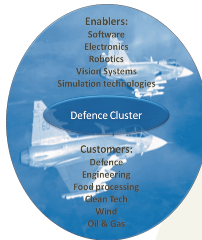
Exhibit Two: Cross Cluster Dynamics of Growth

But let's not forget, these companies also compete against each other: this is a normal dynamic—one we find in “all” clusters.